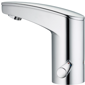
Temperature adjustment lever

For full warranty information please visit www.stiebel-eltron.co.nz/warranty