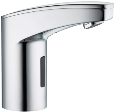
WSH 20 AU